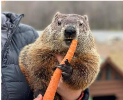
Groundhogs Tater & Yam will be at Chimney Rock's Groundhog Day Celebration

Meeting the 1 st Sunday of this month at the Landrum Depot and the 3 rd Sunday at the Whimsical World Gallery, 116 Jones St in Landrum, SC Mailing Address: UUFCF, P. O. Box 653, Tryon, NC 28782