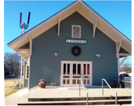
Landrum Depot 211 S. Hwy 562 (parallel to Hwy 176)