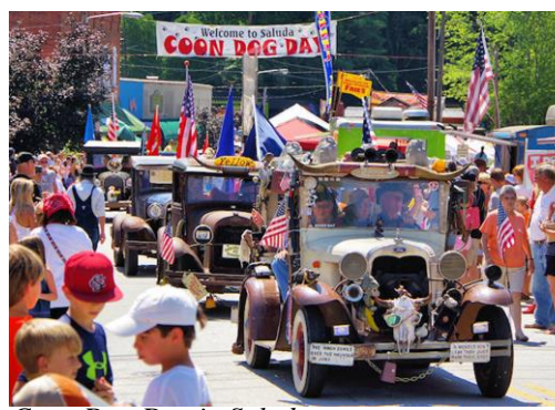
Coon Dog Day in Saluda

Meeting 1<sup>st</sup> and 3<sup>rd</sup> Sundays of each month at the Whimsical World Gallery, 116 Jones St in Landrum, SC Mailing Address: UUFCF, P. O. Box 653, Tryon, NC 28782