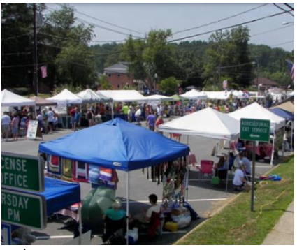
60th Annual Columbus July 4 Festival